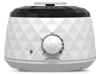
WAX HEATER operation instruction